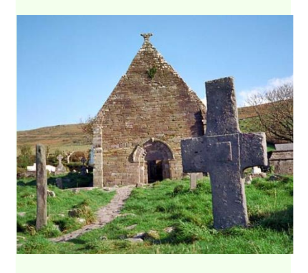
Kilmalkedar Church in Dingle