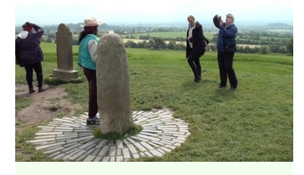
The Lia Fail on the Hill of Tara