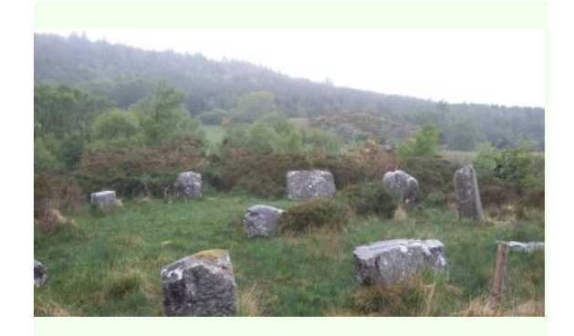
Stone circle of Gurteen